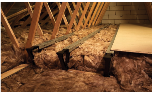
Storage deck in a house